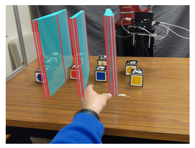
Figure 1: Legible workspace configuration for a tabletop collaborative task as viewed through the HoloLens AR interface. By rearranging items and projecting virtual obstacles (shown in cyan with red edges), the robot improves its probability of predicting the correct cube the human is reaching for (in this case, the blue square cube).

Bradley Hayes bradley.hayes@colorado.edu University of Colorado Boulder Boulder, Colorado, USA