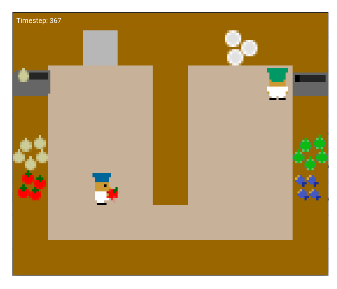
Figure 2: An example of the Overcooked environment. For an evaluation of our system, we would extend layouts used in previous papers to include more tasks and potentially more than two agents.

If the semantic check passes, the consistency monitor enters phase two. In this phase, our system will attempt to find a solution to the MILP using the constraints provided. If a solution cannot be found, the consistency monitor will perform a relaxation check , wherein our system will attempt to solve the MILP by relaxing constraints in C_{user} using, for example, a branch and bound relaxation approach (Clausen